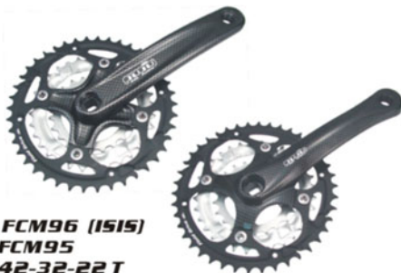
FCM96 (ISIS) FCM95 42-32-22T K (Karbow)