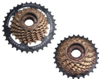
MFM2A (BROWN) 70V 14-34T 70S 14-28T 60S 14-28T 50S 14-28T