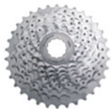
CSM63 8AV 11-34T 8AU 11-32T 8A5 11-28T 8BU 12-32T 8BV 12-34T CSM63 7AV 11-34T 7A5 11-28T 7B5 12-28T 5 (Satin)