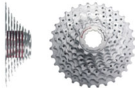
CSM93-9AU 11-32T (Red Spacer)