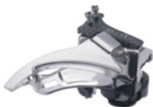
FDM95 LT/MT/ST K (Karbow)