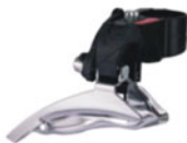
FDM45 (42T) MD/SD