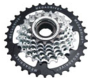
MFM45 7CV 13-34T