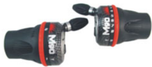
TSM93 R9/L3/LF K (Karbon)