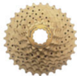
CSMZ4 9AV 11-34T CSMZ4 9AU 11-32T (Ti-Nitride)