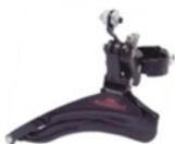
FDM2B (48T) 5B/5T/MB/MT