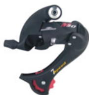
RDM33 LD/LB (7 Speed)