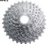
CSMZ4 9AV 11-34T CSMZ4 9AU 11-32T (Satin)