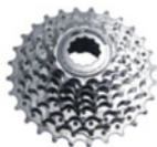
CSM52 8B5 12-28T C (CP)