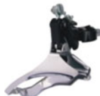
FDM25 (42T) SB/ST/MB/MT