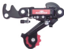
RDM2B LD/LB (7&6 Speed)