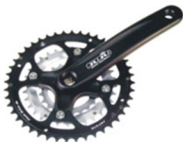
FCM92 (ISIS) FCM91 44-32-22T