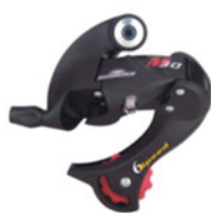
RDM33 SD/SB (6 Speed)