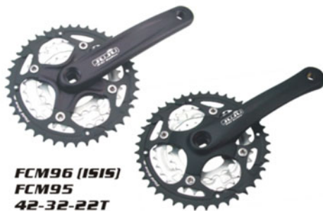
FCM96 (ISIS) FCM95 42-32-22T