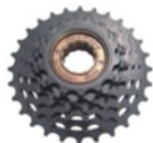
MFM05 7CS 13-28T 6DS 14-28T 5DS 14-28T