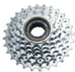
MFM22 6DS 14-28T U (UCP)