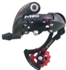
RDM93 LD K (Karbon)