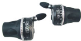
TSM95 R9/L3/LF K (Karbow)