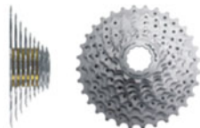
CSMX4 9AV 11-34T CSMX4 9AU 11-32T (Alloy Spacer)