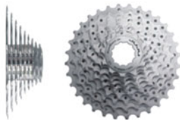
CSM95-9AU 11-32T (Alloy Spacer)