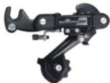
RDM2T LD/LB (7&6 Speed)