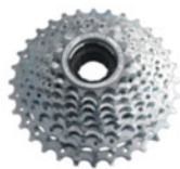
MFM60 8CU13-32T U (UCP) C (CP)