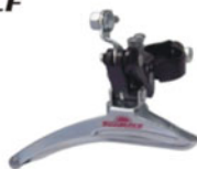
FDM06 (Double) SB