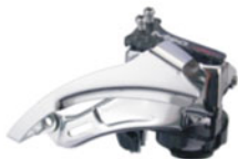
FDM93 LT/MT/ST K (Karbon)