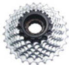
MFM52 MFM55 8C5 13-28T U (UCP)