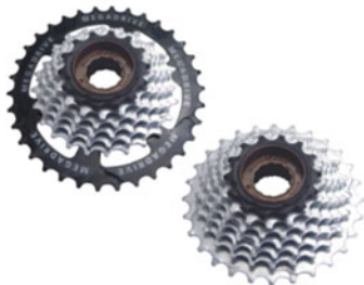
MFM2A (UCP) 70V 14-34T 70S 14-28T 60S 14-28T 50S 14-28T