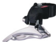
FDM33 (48T) MD/SD