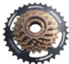
MFM08 (BROWN) 7CV 13-34T 6DV 14-34T