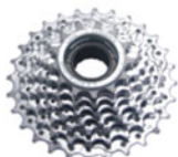
MFM30 7CS 13-28T U (UCP) C (CP)