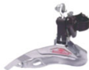
FDM2A (48T) SB/ST/MB/MT