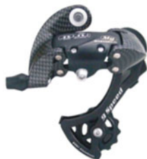
RDM95 LD K (Karbow)