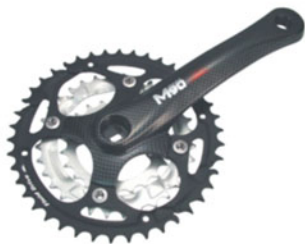
FCM93 42-32-22T K (Karbon)