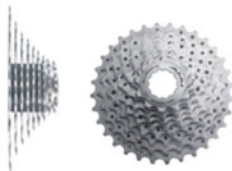
CSM94 9AV 11-34T CSM94 9AU 11-32T