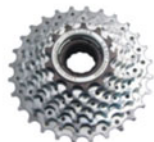
MFM35 7CS 13T-28T U (UCP)